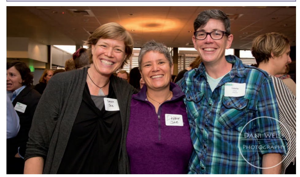
OUTRight Action International and Seattle Women's Pride were the Women on Top featured nonprofits at Frolik Kitchen + Cocktails' rooftop gathering space. Thank you Seattle Storm, Women on Top sponsor, and media partners Encore Media Group and Pacific Publishing.

GSBA participated in the Mayor's Commercial Affordability Advisory Committee to find small business solutions to the Puget Sound region's affordability crisis. Elevating your voice, GSBA worked closely with the City of Seattle on several LGBT issues such as addressing rising bias crimes and implementing a ban on conversion therapy.