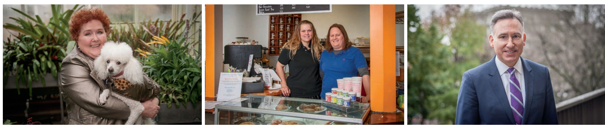
Paris Insurance Services. Owner